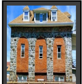
UNO BEACH HOUSE GAP YEAR RESIDENCE

GAP YEAR student housing is at our UNO Beach House. There are 3 floors: one for female Interns/missionaries, one floor for male interns, and another for UNO Staff. The house is located in a beach community just a few minutes walk from the beach and Atlantic Ocean. All UNO GAP YEAR & INTERN students are required to live in the UNO Beach House during their term.